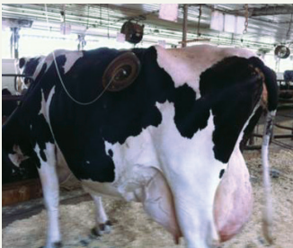
Research cow used to validate lysine bioavailability in Plasma Free AA Dose-Response Technique — University of New Hampshire

Lysine is a limiting, essential amino acid, critical to a cow's productivity. BOVI-LYSINE delivers it more consistently. QualiTech's rumen-protected lysine offers you an economical option to more traditional metabolizable lysine sources and is effective, credible and reliable.